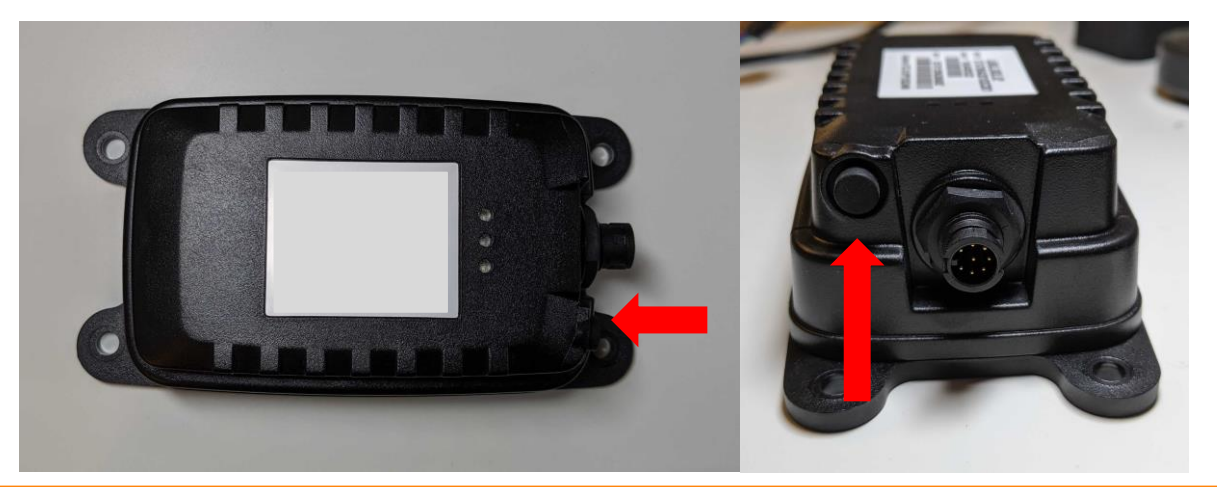
Step 1: Press and hold the black button next to the wiring harness port for 10 seconds to wake the device, lights will flash on the unit.

Step 2: Take note of the device's Activation Code.